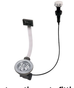
Automatic waste fitting 8407 000